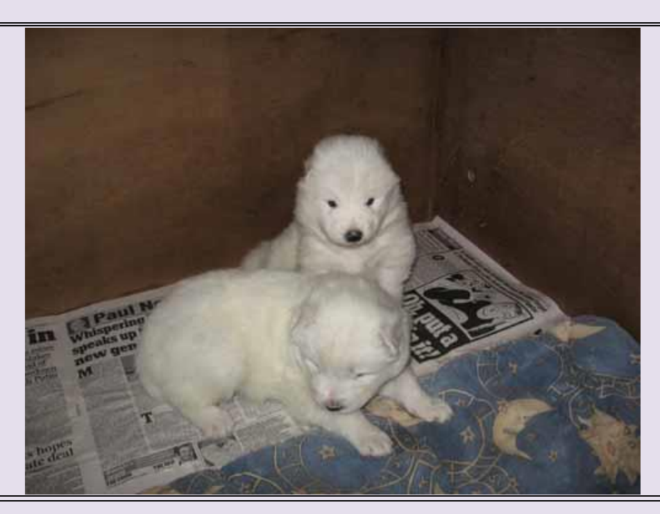
Looking cute at 3 weeks