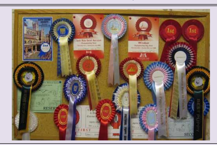
The Trophy board after only a couple of weeks in the ring. Lets hope he can keep it up.