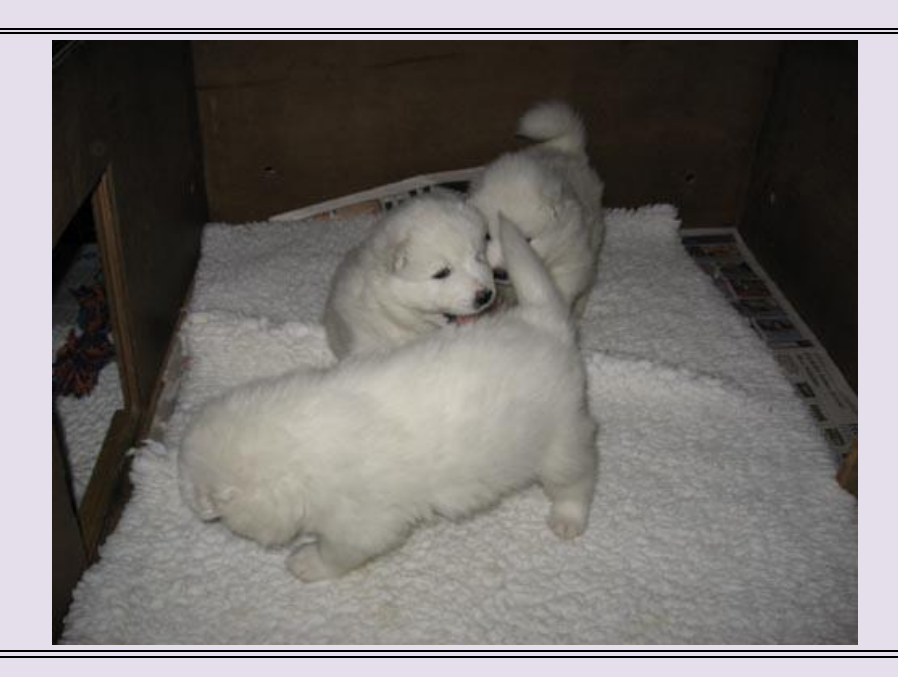
Four weeks old and beginning to play like real dogs