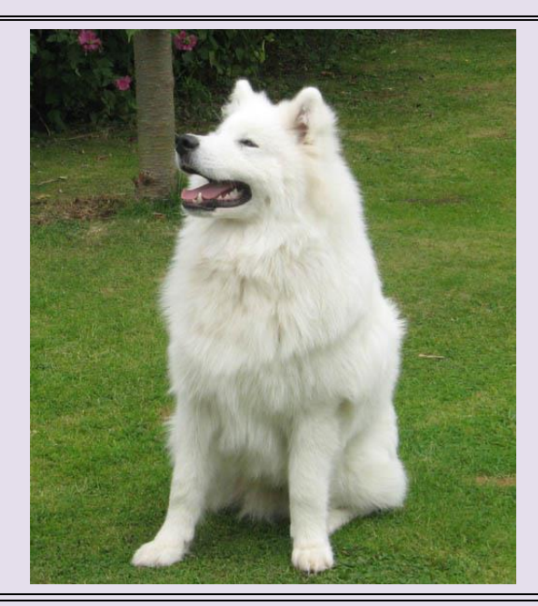
He has started his showing career with remarkable success so far. The trophy board below shows what he has managed to win in only his first 2 weeks (actually one or two of the rosetes were won by his mum, but most are his)