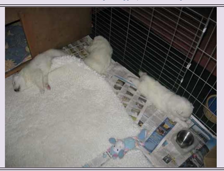
We are big boys now, we have a run as well as our box