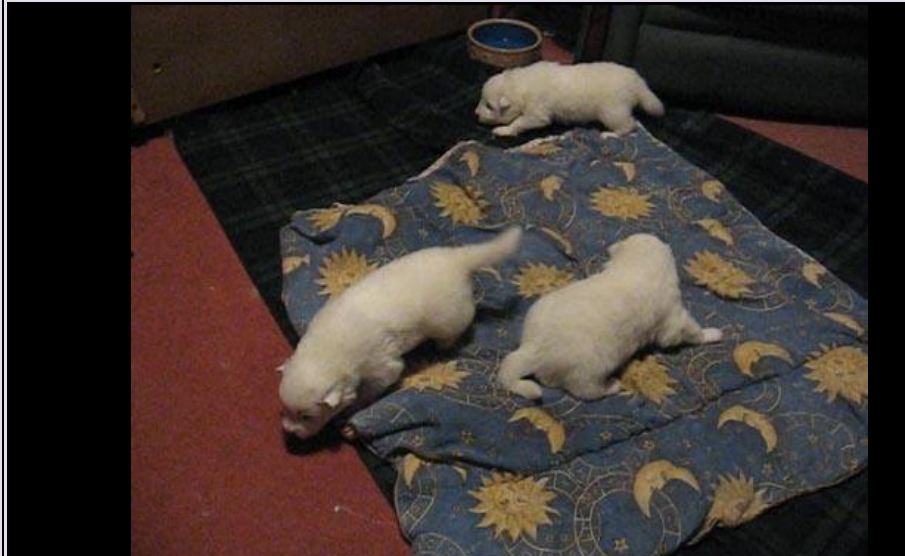
15 days old and first time out of the whelping box (Click on the picture above to see the puppies in puppies in Video)