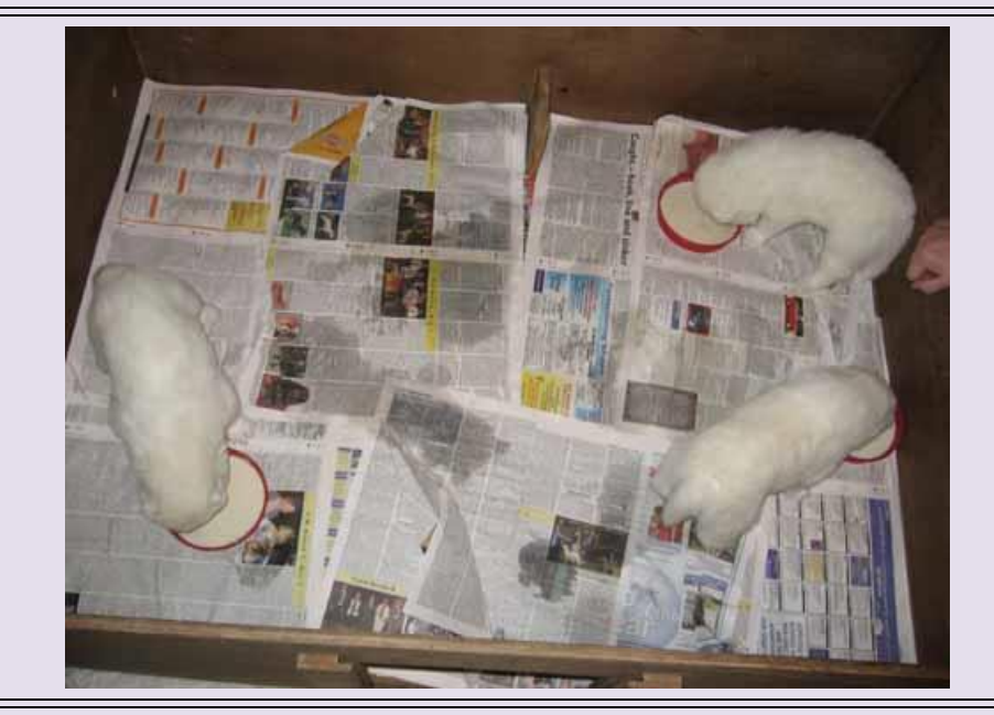
3 weeks today and we have been weaned, now it really gets messy