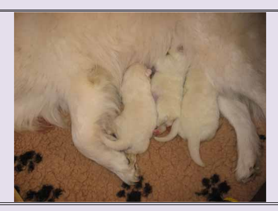
All feeding well at 1 day old