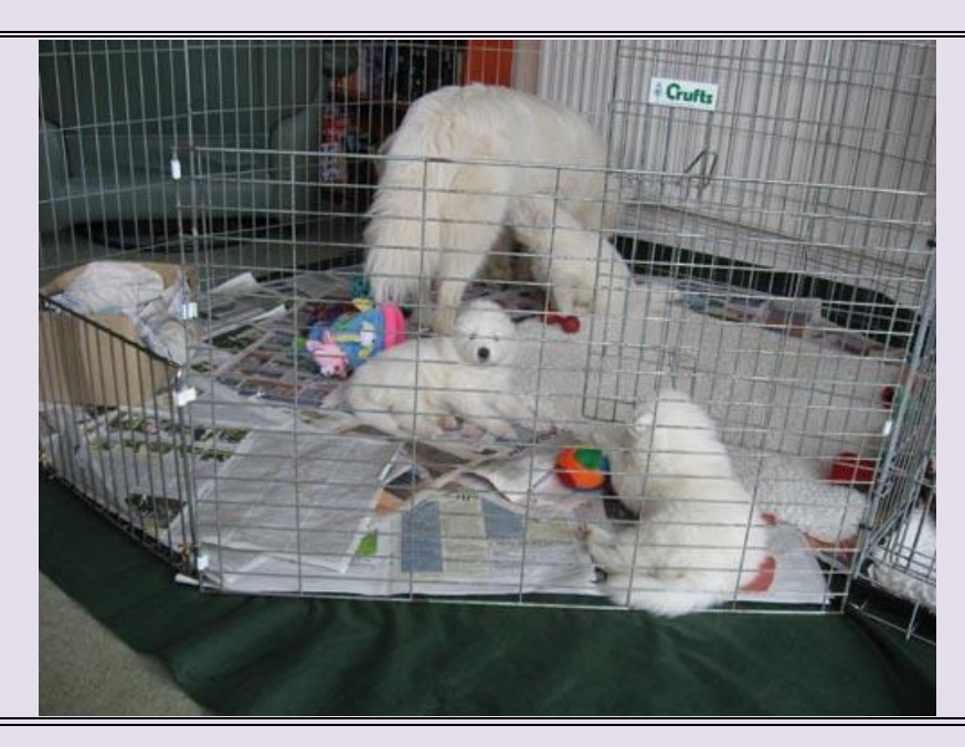
Now we are 4 weeks old we get a bigger pen nearer the garden