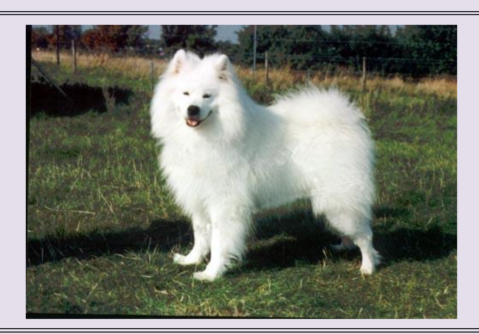
Dad (Sylvastones Tazinskistar) - Taz