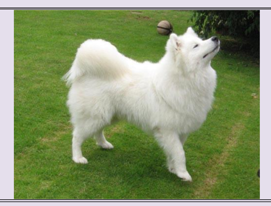
Time flies and Barney, the pup we kept from Ellie's litter is now 6 1/2 months old and as big as his mum already.