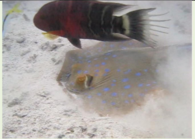
Click picture to see video