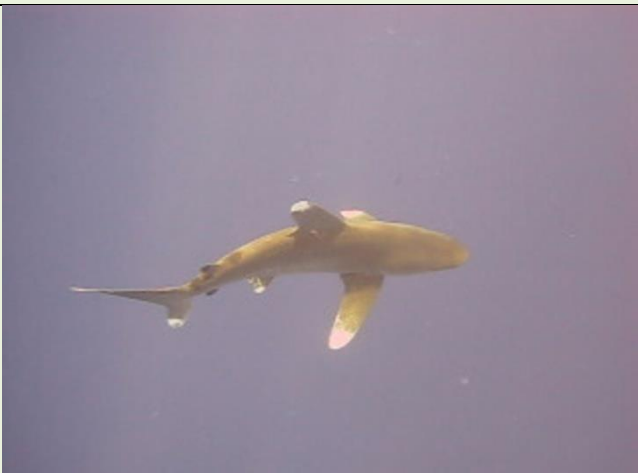
Click picture to see video