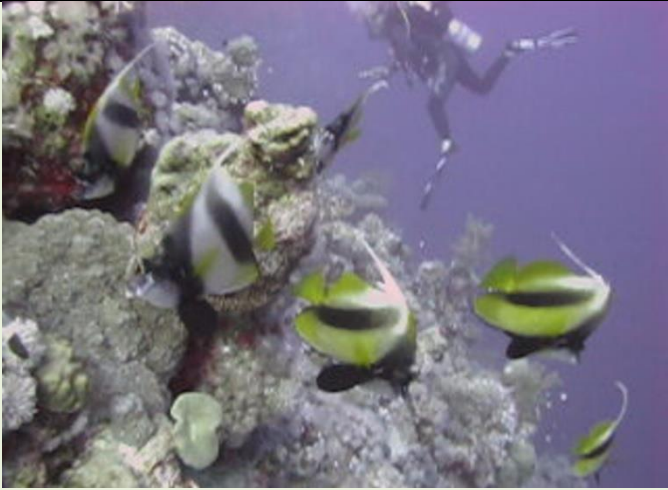
Click picture to see video