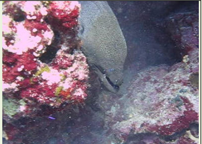
Click picture to see video