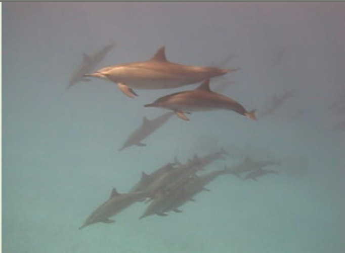
Click picture to see video