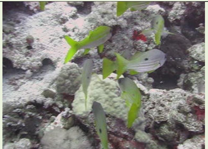
Click picture to see video