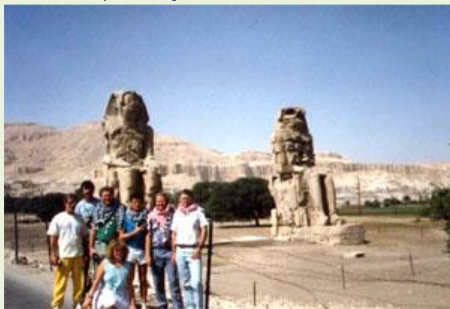
Not sure whose temple this was but its a nice group photo