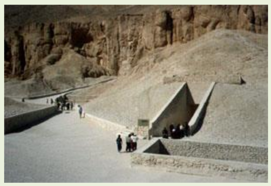
Valley of the Kings - Tutenkhamuns Burial Chamber