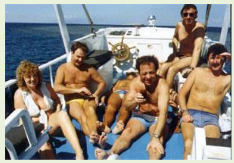
Sunbathing between dives - note how small the boat is