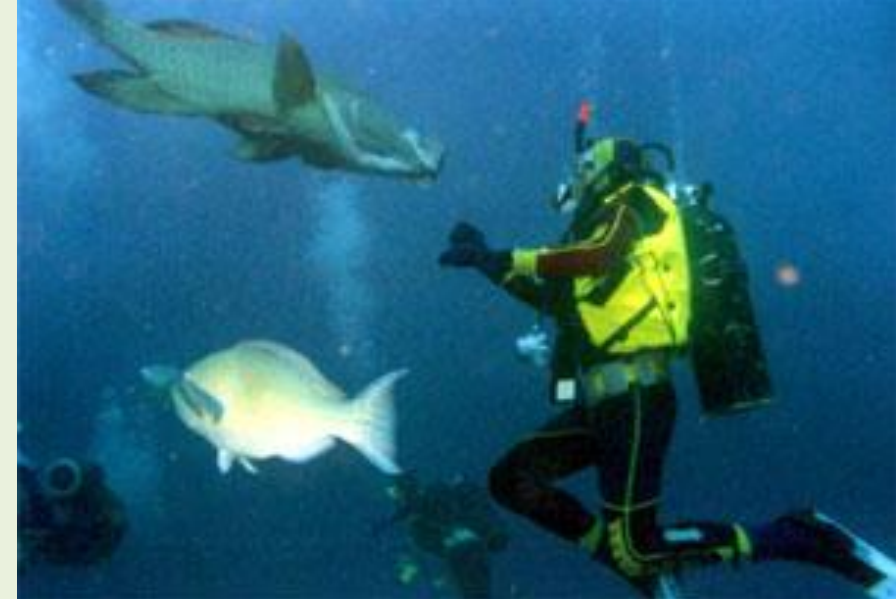
Feeding a Naploeon Wrasse with eggs - banned a few years later as it proved to be injurious to the fish.