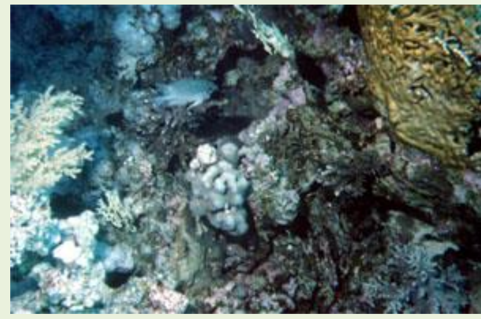
Hard corals in good condition