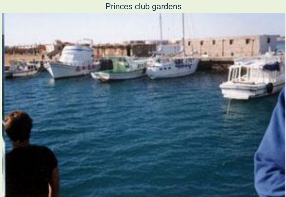
Princess Club Marina