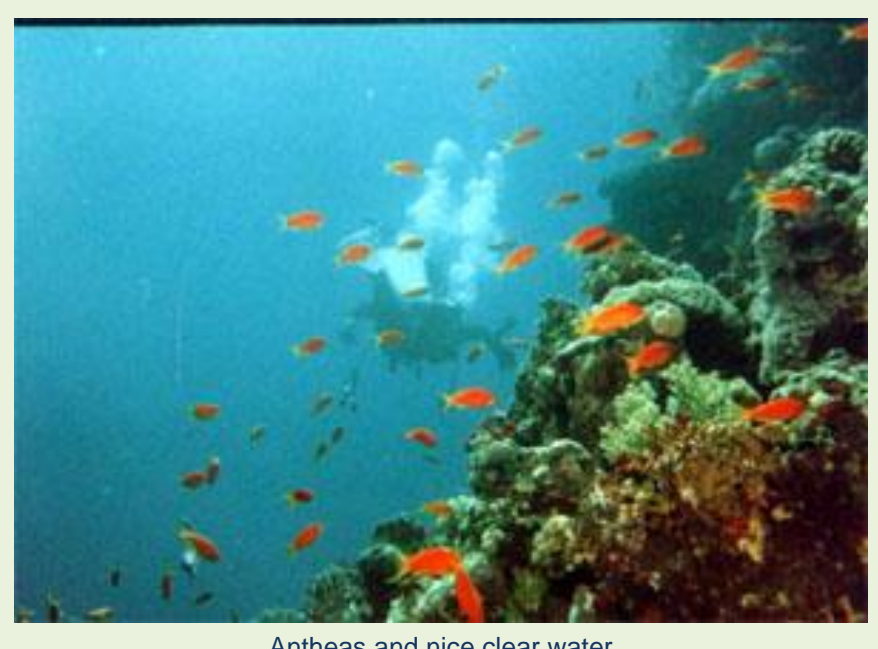
Antheas and nice clear water