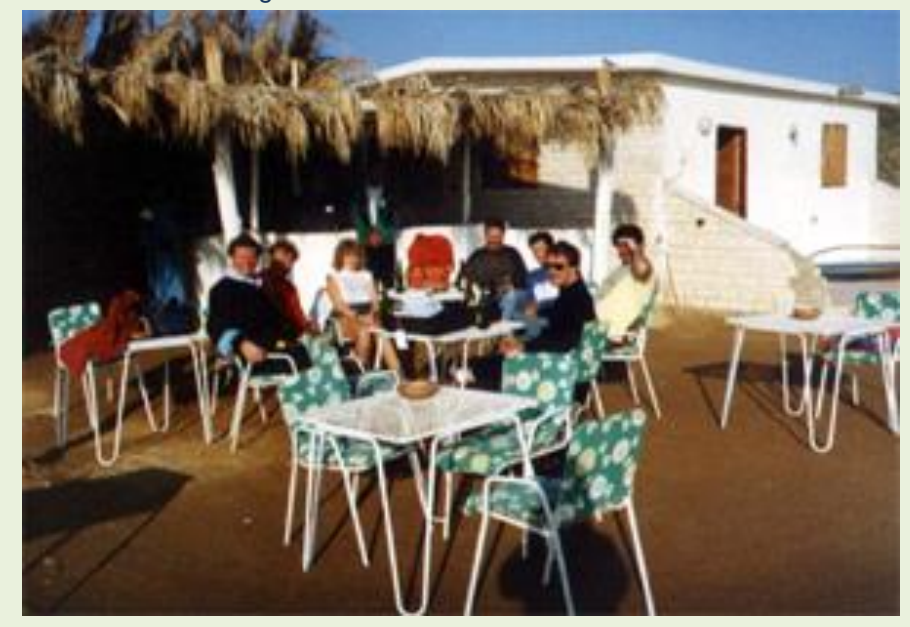
Relaxing after a days diving