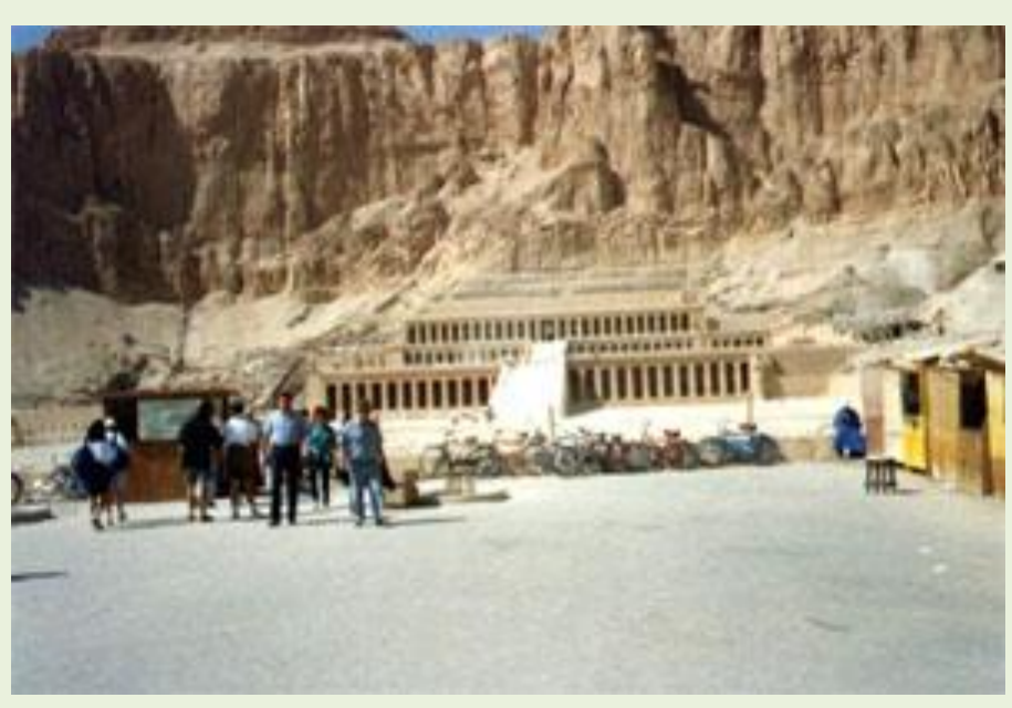
Temple of Hatshepsut - Valley of the Queens