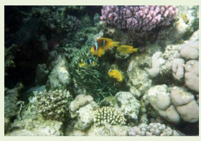
Clownfish and nice coral

The pictures were all taken with my Nikonos 5 camera (and an Ikelite Strobe for the u/w scenes). They were scanned at fairly low resolution from the original prints in 2003 so they are pretty dire. This is just a small selection: