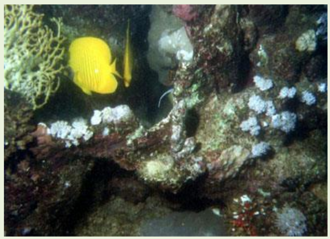
Butterfly Fish being coy