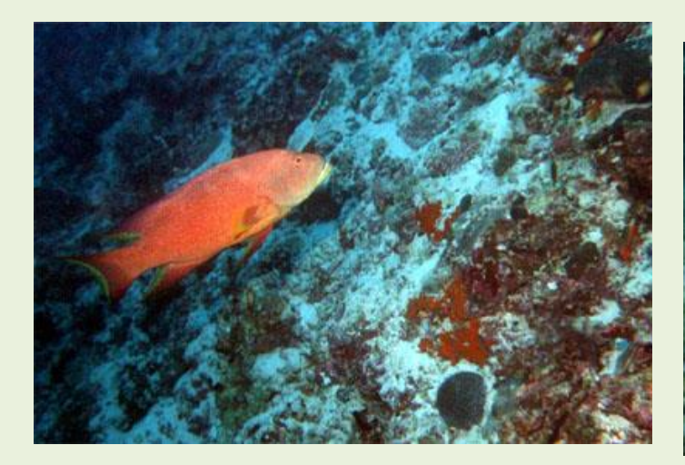
Lunar Tail Grouper. They appear bright blue underwater