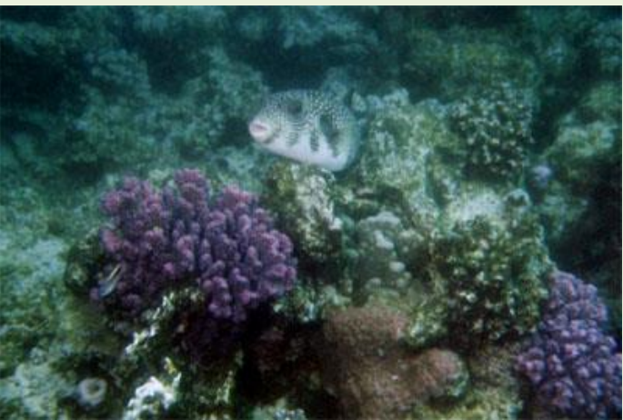
Small pufferfish in typical pose