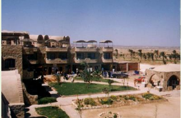
Another view of the hotel and dive shop.