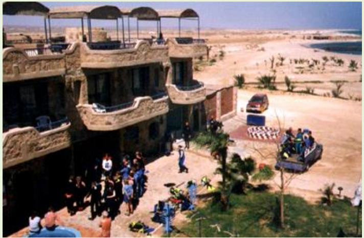
View of the dive shop. In the top left is the jetty where the cruiser Pensee was moored for our trip in 1995