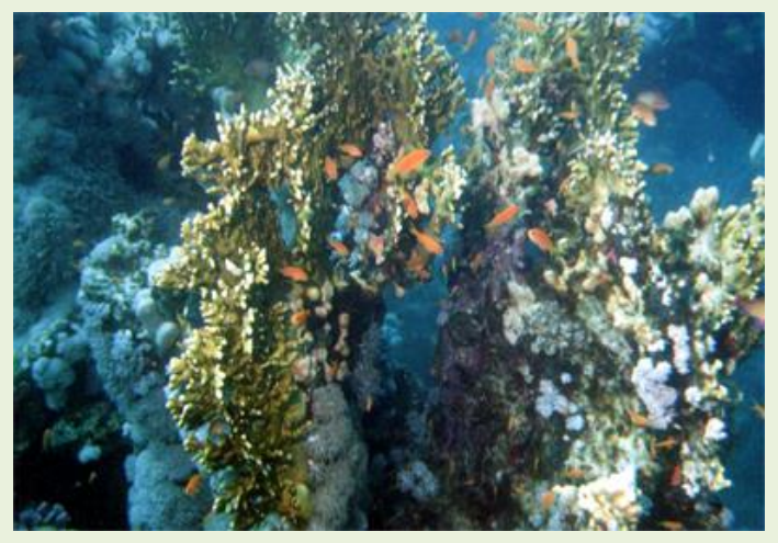
Antheas in nice staghorn coral