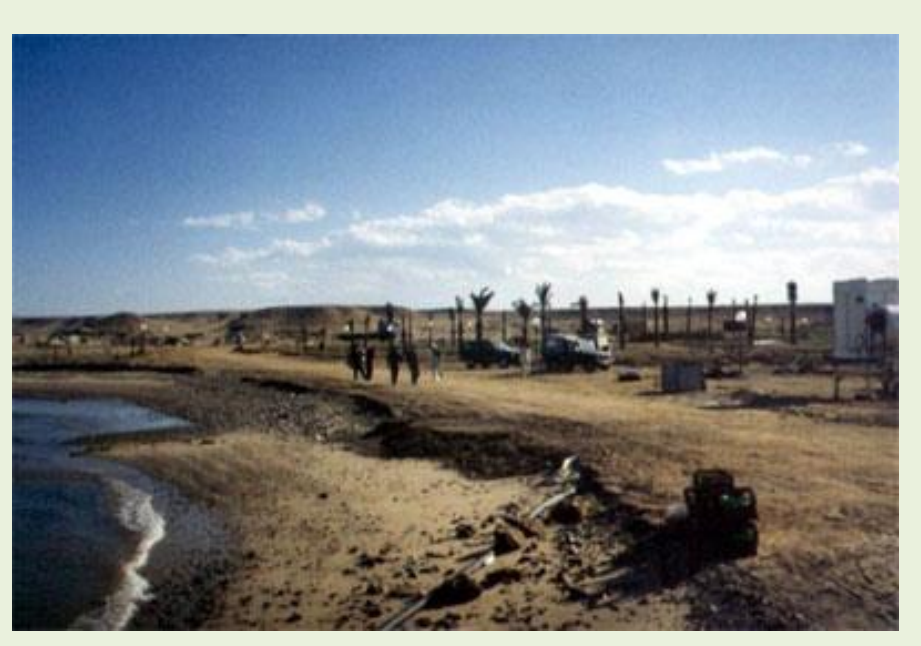
The beach at Quseir. you can see the site of the hotel in the background