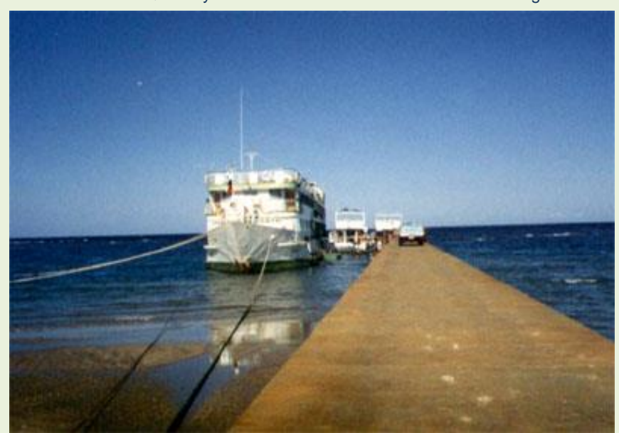
Jetty at Quseir