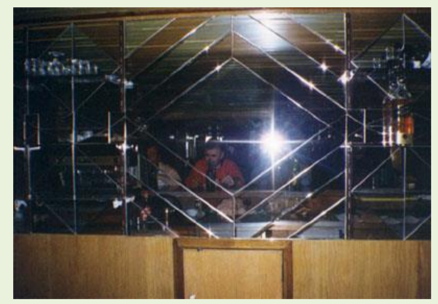
The bar of the Pensee, We spent a lot of time here as there was not a lot else to do.once the days diving was finished.