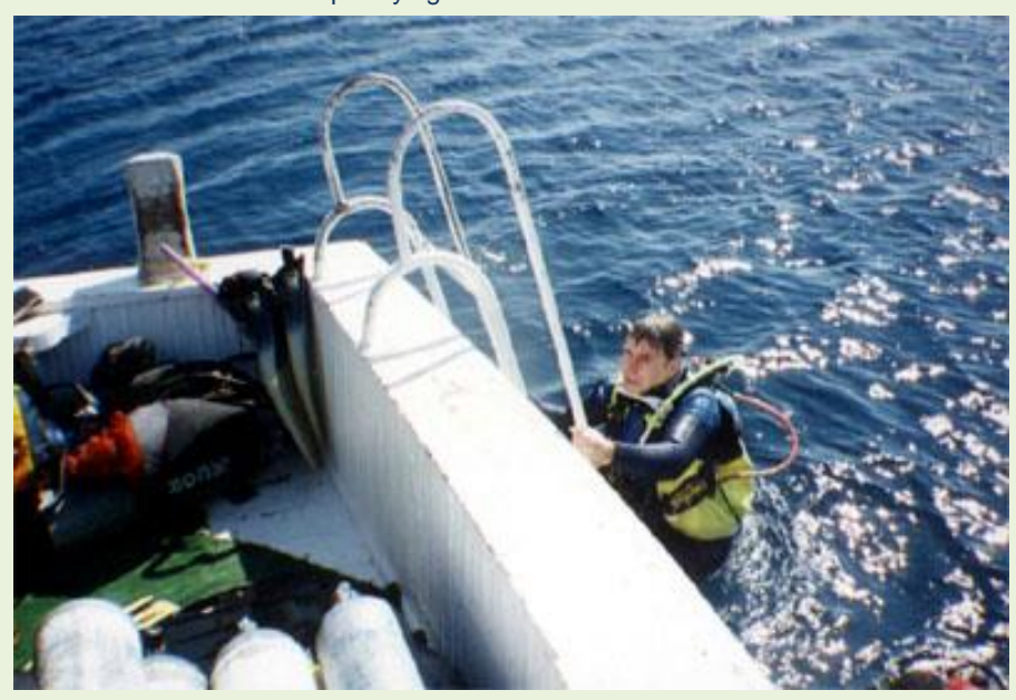
Me climbing back aboard the dive boat. Note the ladder over the side rather than the more normal stern platform.