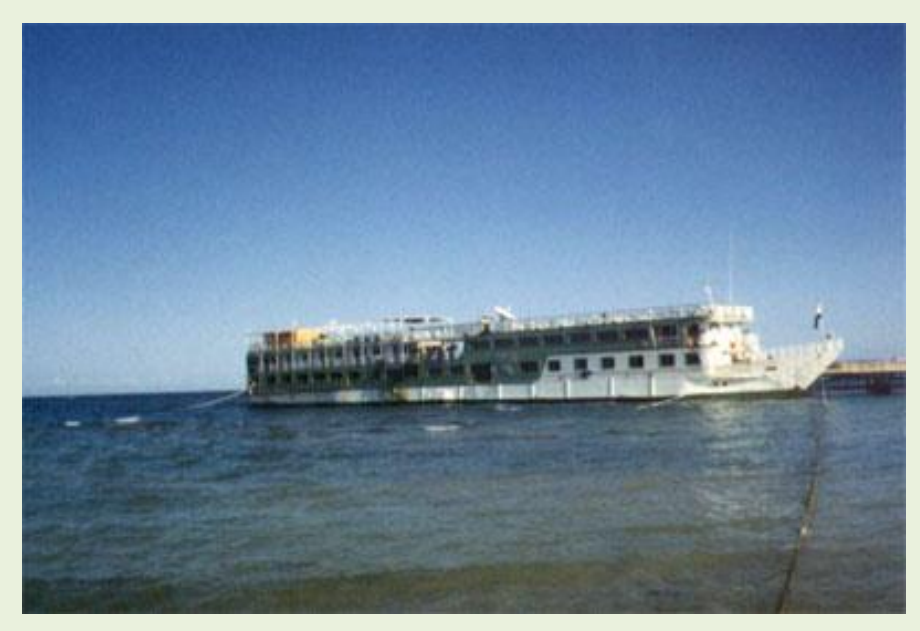
The Nile cruiser Pensee