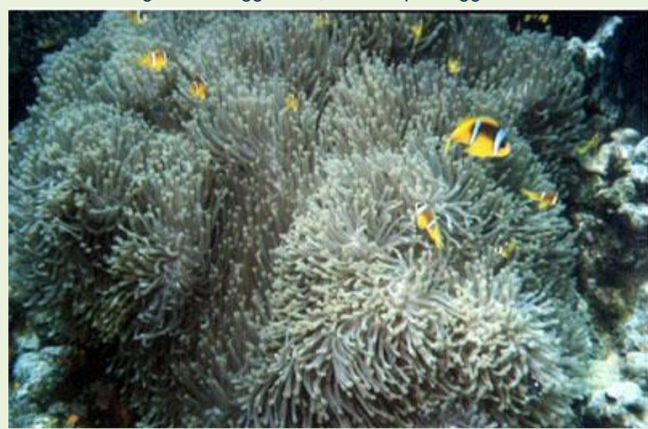
Colony of Clown Fish in a huge Anemone