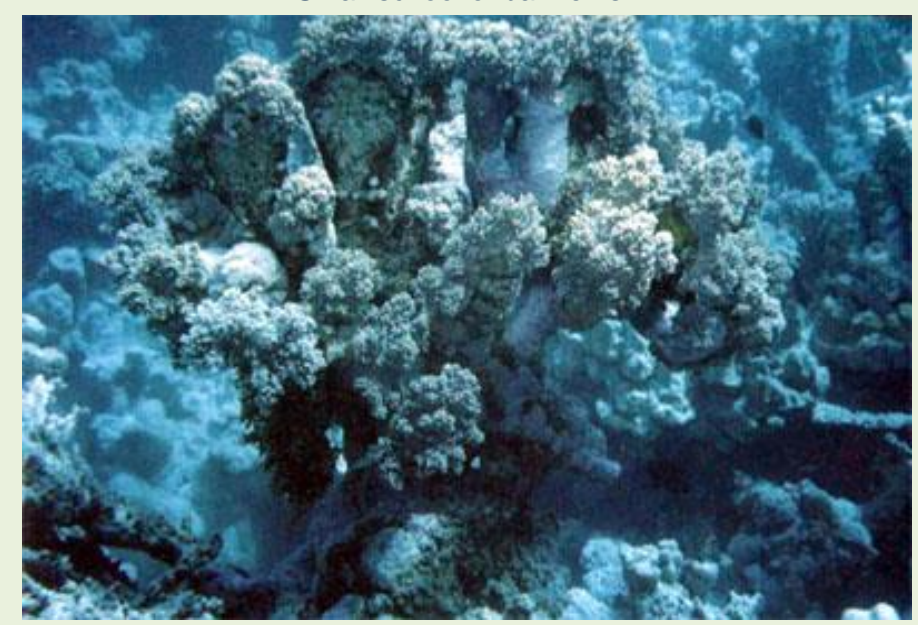
Cauliflower soft corals