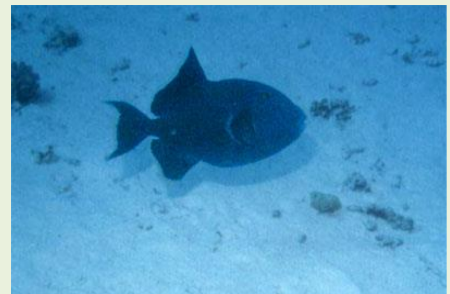
Large Blue Trigger fish, can be quite aggressive