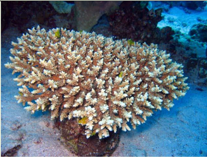
Small coral head with some rare tiny yellow fish which Danielle was very excited about – name forgotten