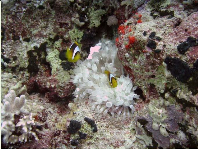
More clown fish, perhaps the most photogenic of the Red Sea's inhabitants