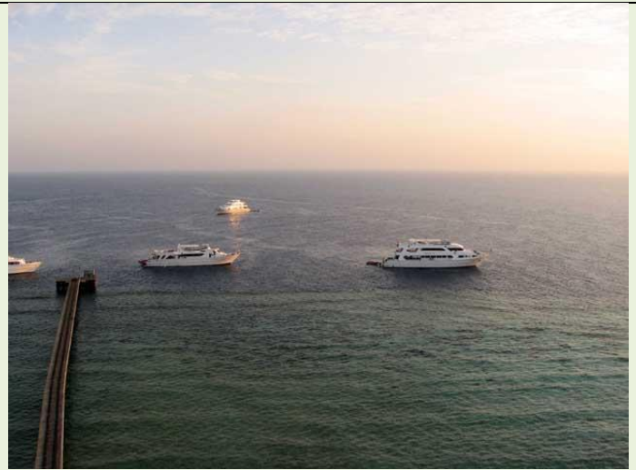
View of the mooring at Daedalus from the top of the lighthouse. Elite is the farthest boat awaiting our return before heading off to Rocky.