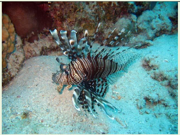
Lion Fish on the prowl