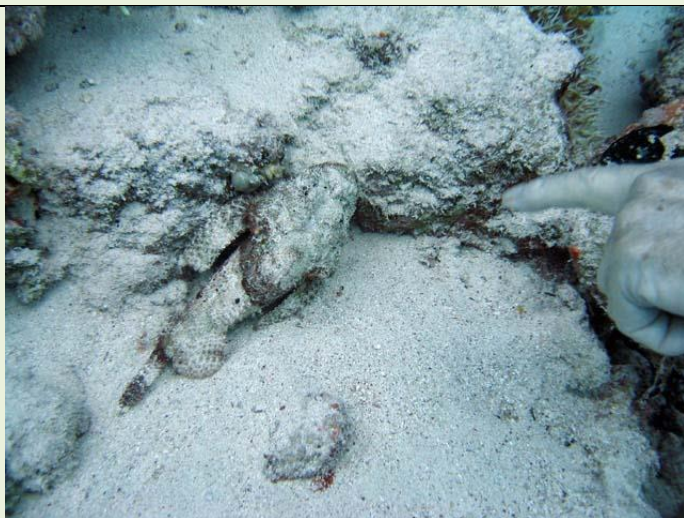
A young scorpion fish showing how effective they can camouflage themselves