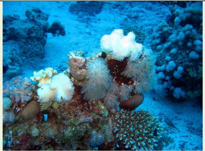
Nice collection of soft corals and sponges