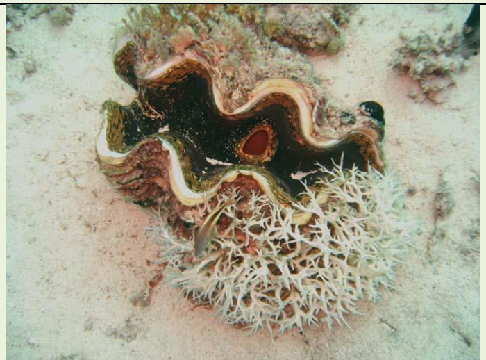
A giant clam unusual in that it is just sitting on the sand. Normally they are embedded in the coral