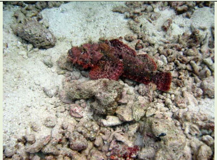
A Scorpion Fish before it had a chance to change colour to match its background