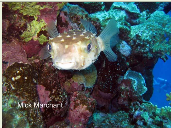
A porcupine puffer fish

A selection of pictures of the trip. As will be seen in the credits, not all the pictures were taken by me. Where someone else got a better photo than mine I have with the authors permission, included the best shot.