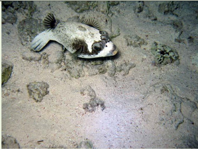
Puffer Dish caught in the glare of the torch