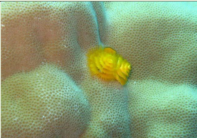
Close-up of a yellow Christmas Tree worm