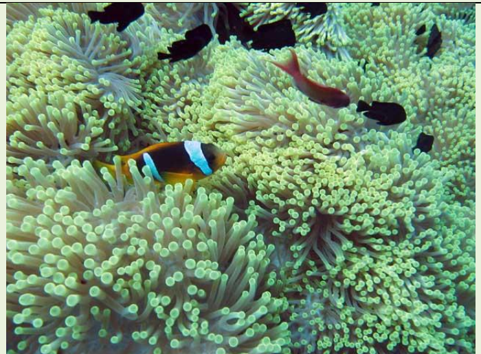
Close-up of the anemone and its resident clown fish