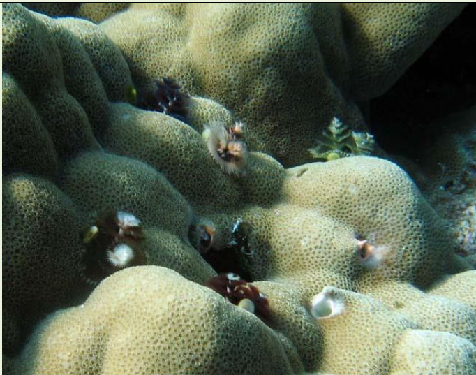
Yet more Christmas Tree worms