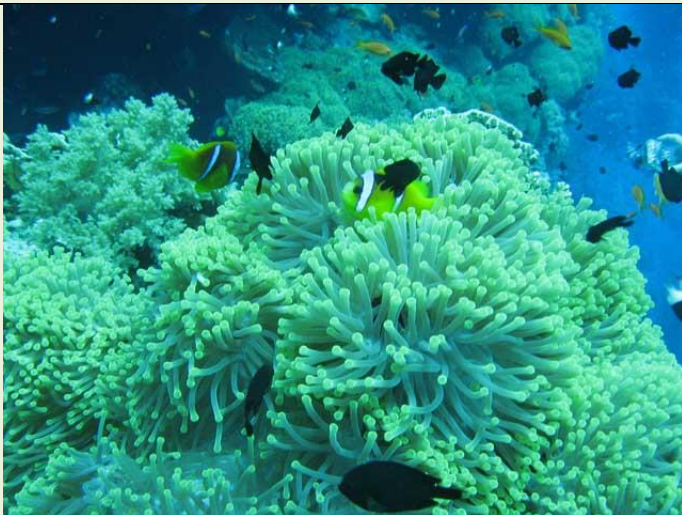
Part of aneome city at Daedalus