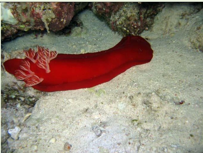
A Spanish Dancer caught ona night dive. Never yet seen one swimming.