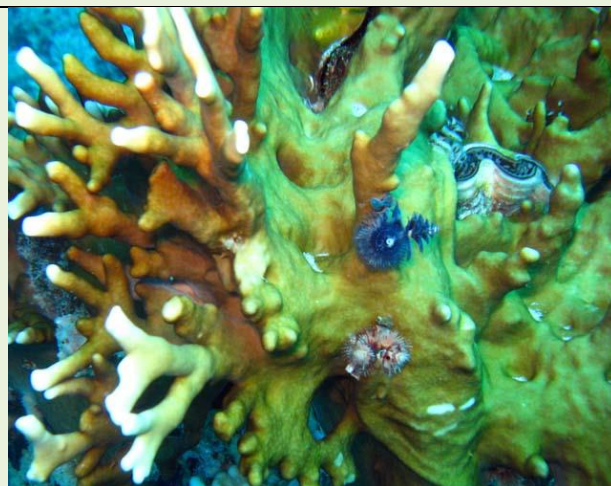
My personal favourite, Christmas Tree worms