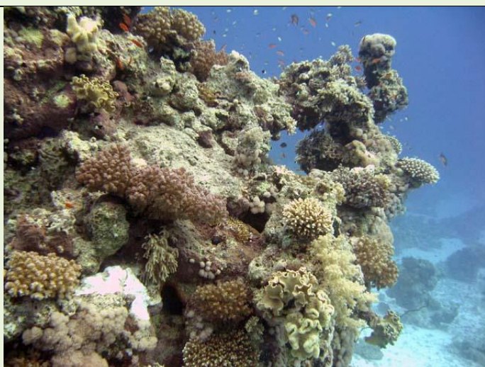
Nice scenic view