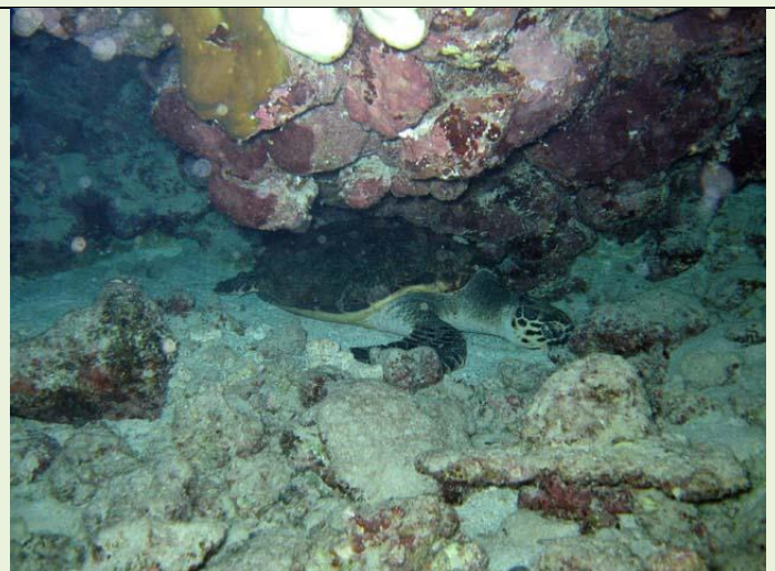
On the same dive we found this turtle asleep under a ledge. Despite being air breathing mammals, they can slow down their metabolism and stay down for hours