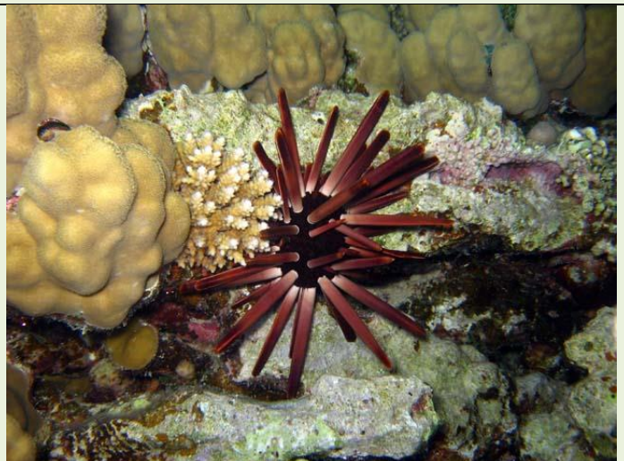
These things only appear at night and