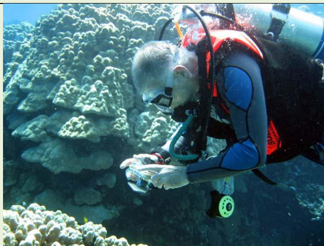
Me taking a shot of some unsuspecting creature