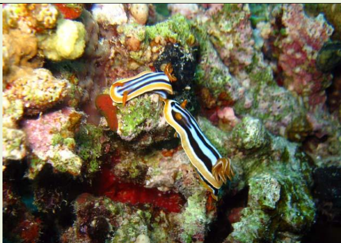
A pair of pillowslip nudibranches