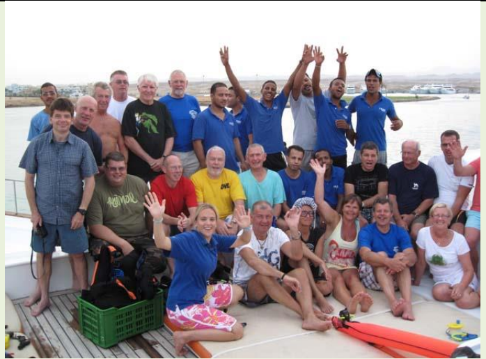
Group photo on the last day