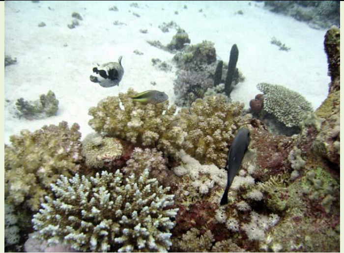
Puffer fish, hawkfish and nice hard corals