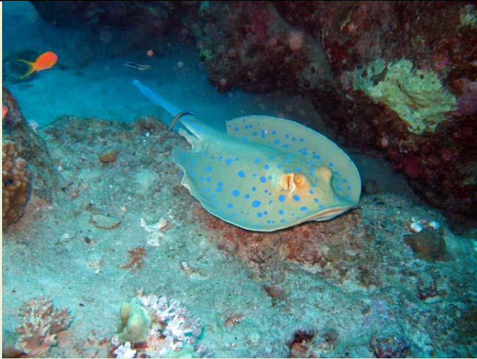
Blue Spot Ray with a cleaner wrasse on his tail