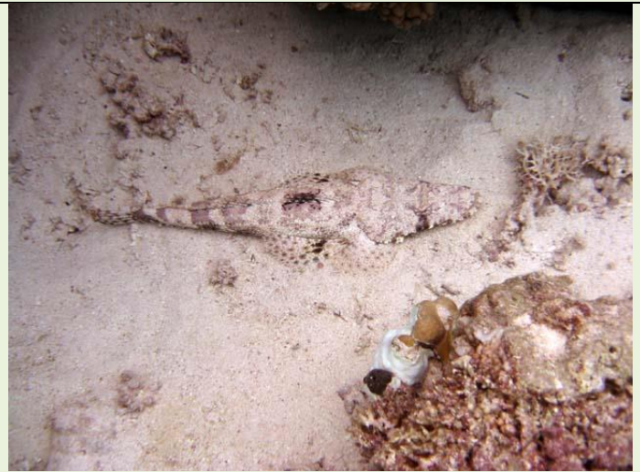
A crocodile fish, the only one we saw this trip. Very hard to get good photo of these creatures.