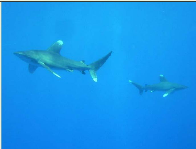
A brace of Oceanic White Tips. Not sure who took this photo so unable to give credit but a cracking shot