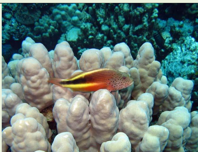
A hawkfish in typical pose