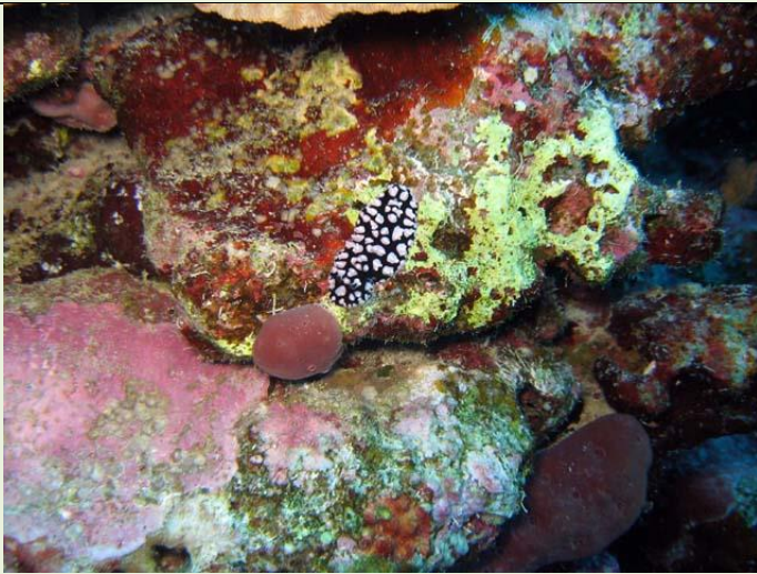
Another type of nudibranch