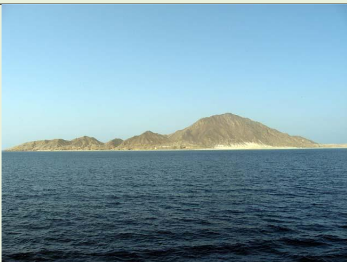
Zhabargab Island, Known in Roman times for a semi-precious mineral which was mined there until recently