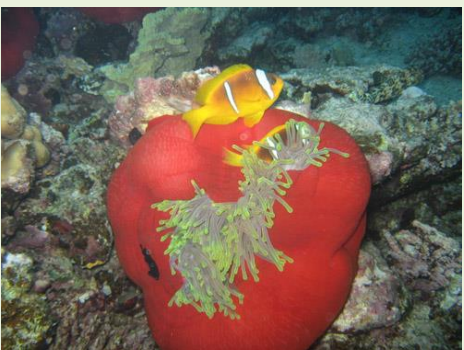
An anenome inside out, something I had rarely seen before but very common at UmmAsk reef