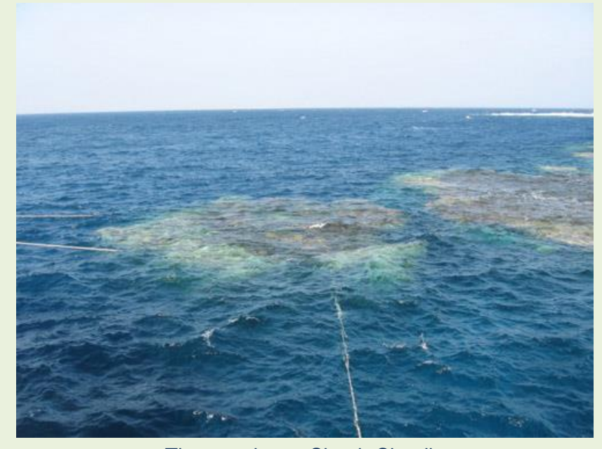
The mooring at Shaab Claudia