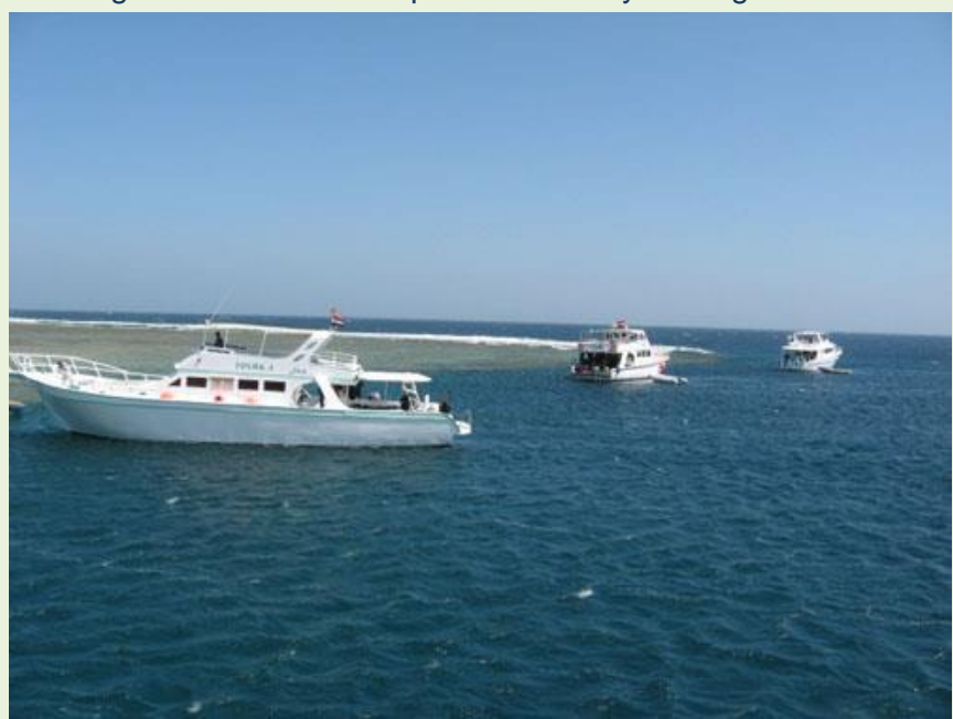
The reef edge at Abu Dhabab