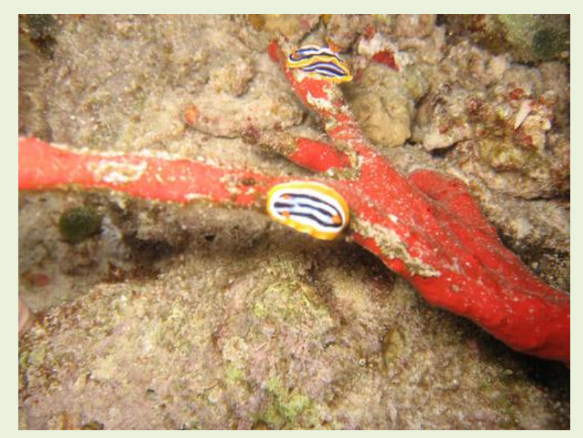
A couple of pyjama nudibranches found on a night dive at Wadi Gimal