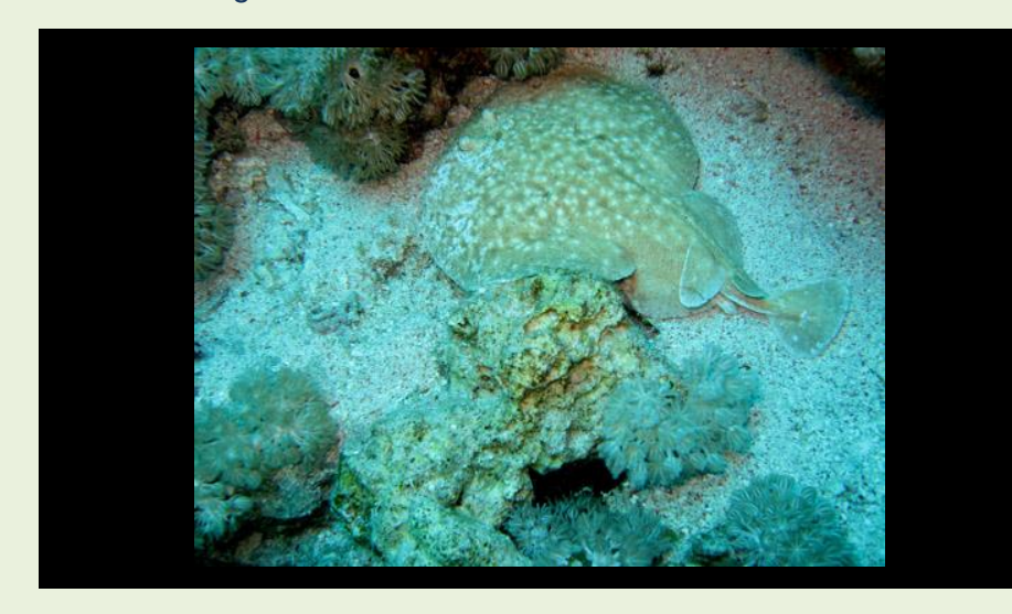
Small Ray seen at Rocky of a type unknown and not seen before