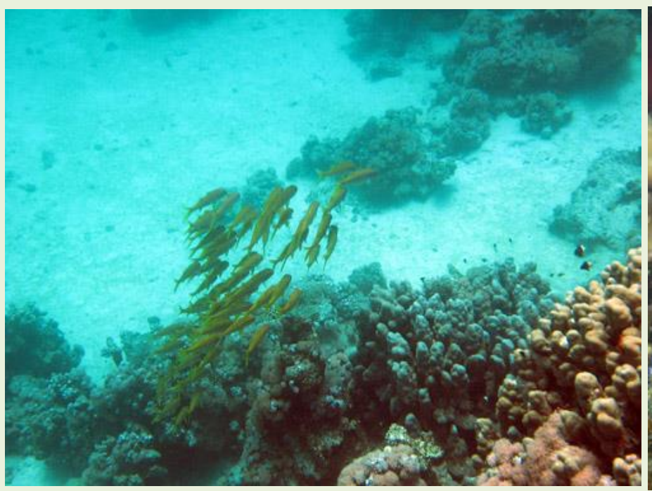
Shoal of goatfish at Abu Galawi where we did our check dive