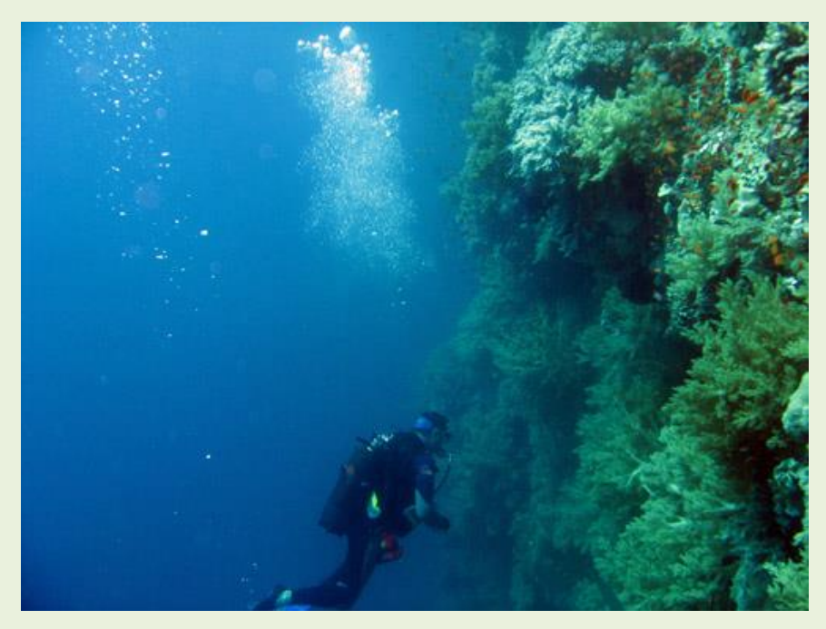
The reef wall at Daedelus