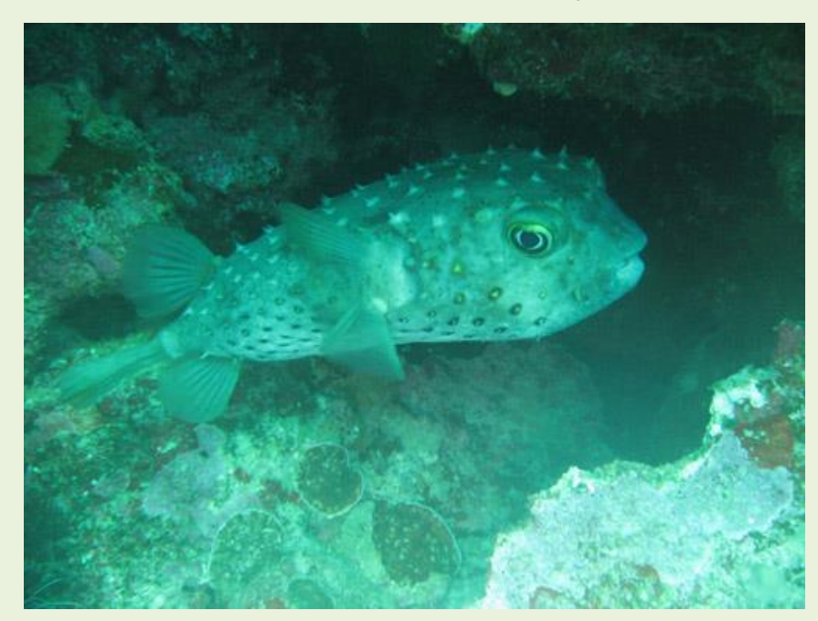
Big Boxfisf at Daedelus