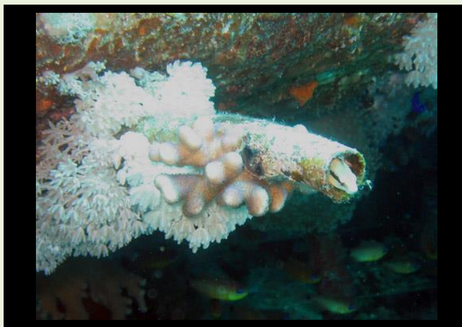
Gobi hiding in the end of a pipe