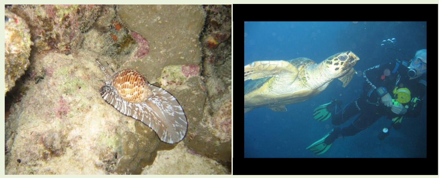
Large Snail found on night Dive at Wadi Gimal