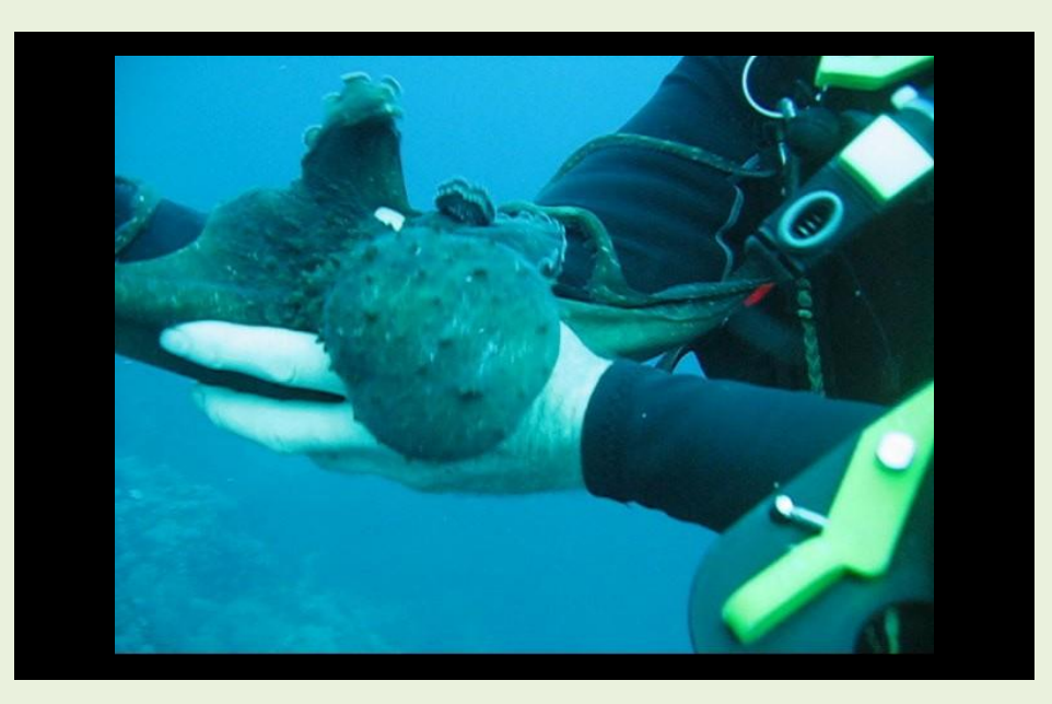
Ken holding a small Octopus found on Zabargad