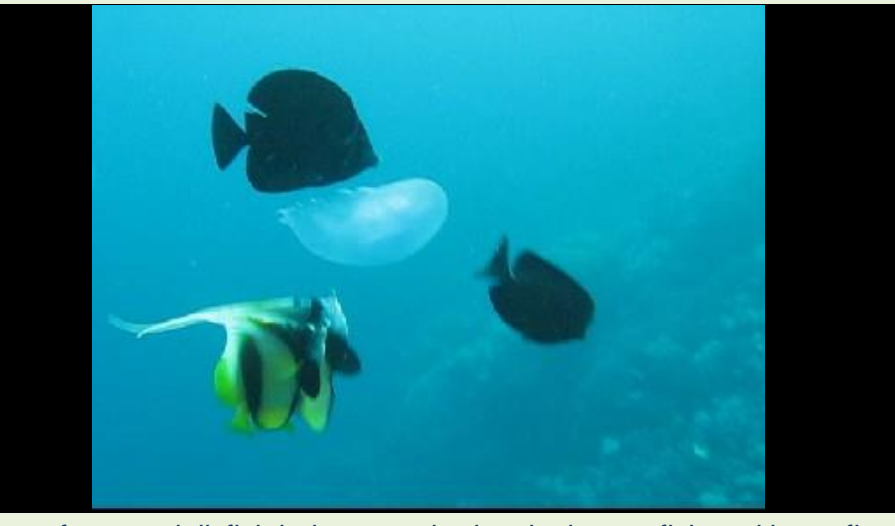
An unforunate jellyfish being munched on by bannerfish and butterfly fish