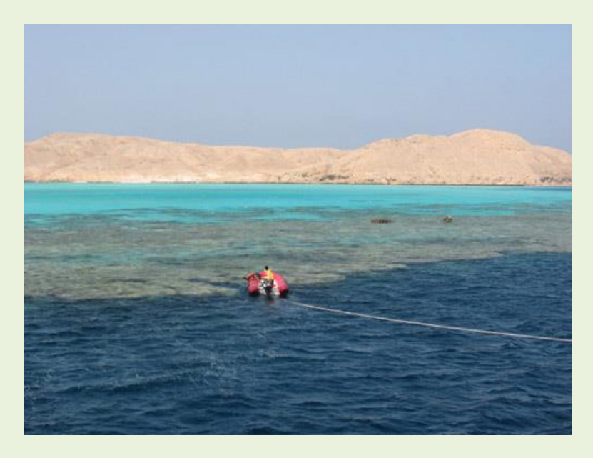
Mooring at Rocky Island