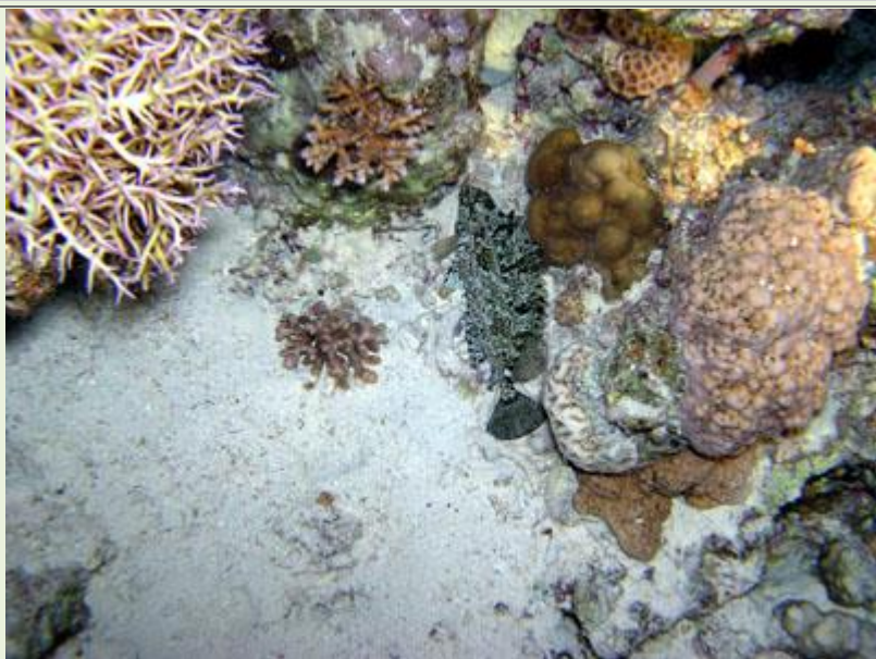
More nice corals