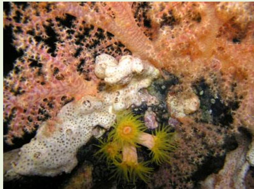
Night pictures really seem to bring out the colours in the soft corals