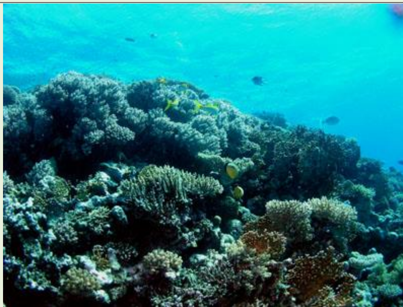
Box fish - largish, about 1/2 metre in length.