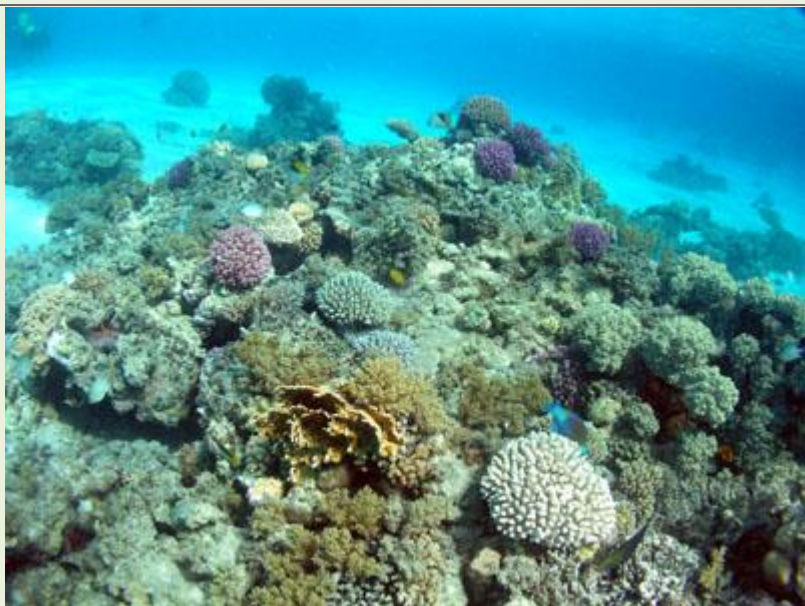
Titan Trigger Fish, big ugly and aggressive at times