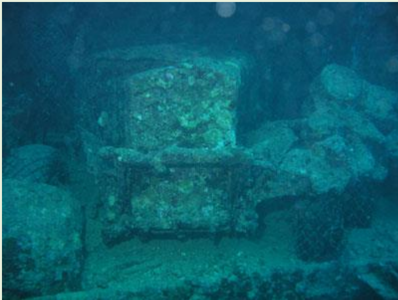
Front of a Bedford truck in the hold of the Thistlegorm