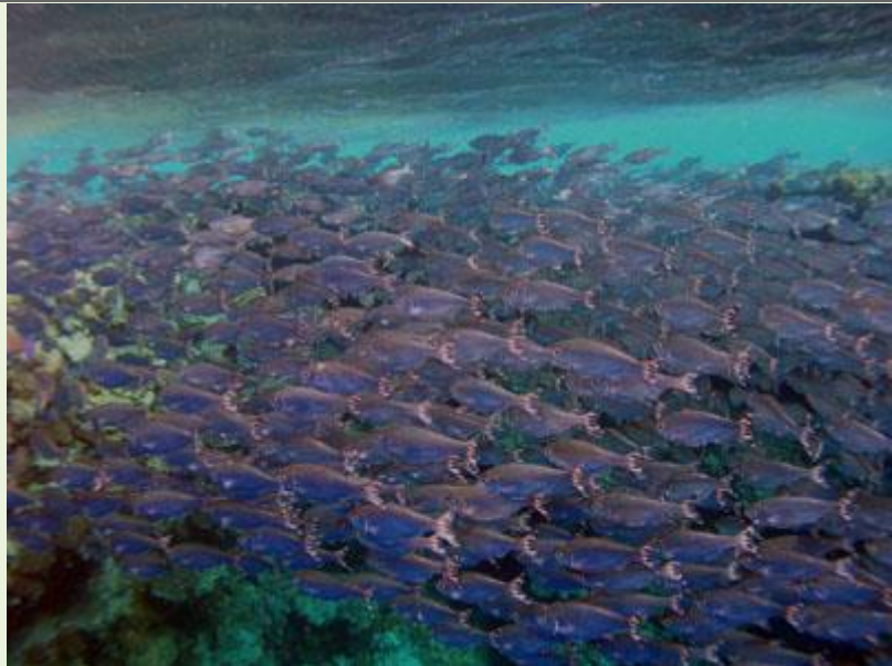
Shoal of Fusilier fish at Big Brother