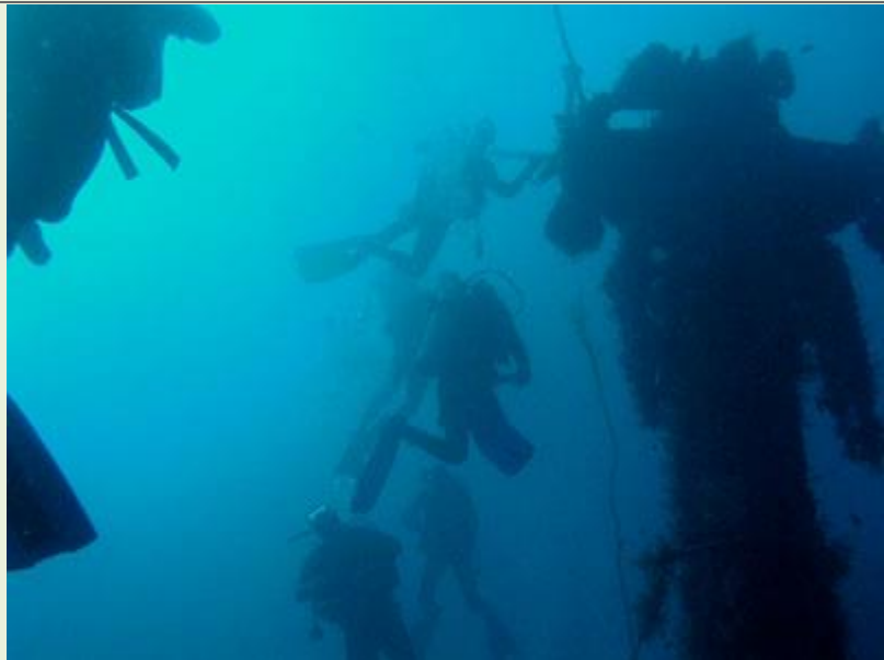
divers ascending to the shot line at the Rosalie Moller