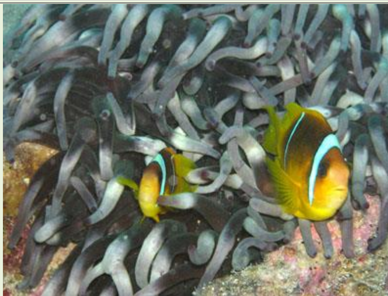
Some nice corals on the reef outside Shaab Mahmoud