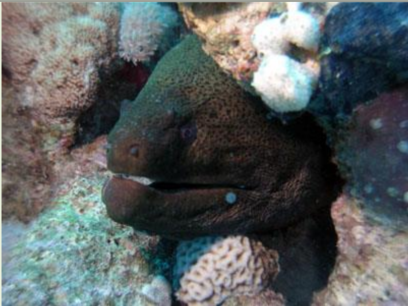
Close up of a brown Moray Eel