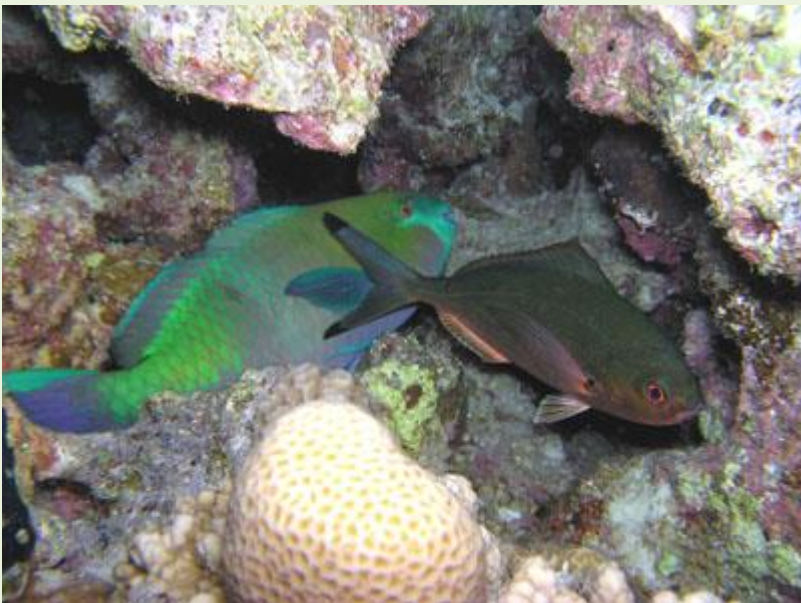
Parrot Fish and something unknown sleeping at night