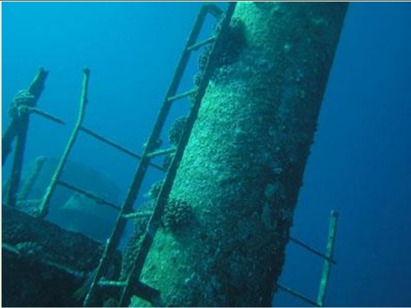
BAAnother nice collection of hard corals at Shaab Mahmoud