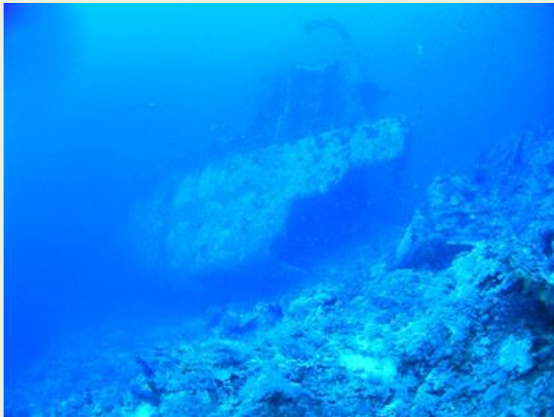
Wreck of the Aida on Big Brother, we are at 35M hence lack of light