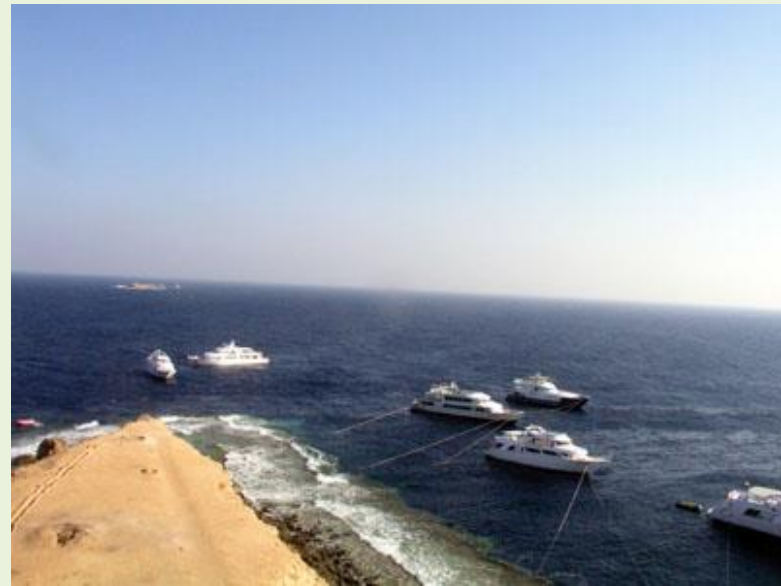
View of Big Brother taken from top of lighthouse. Little Brother in the distance