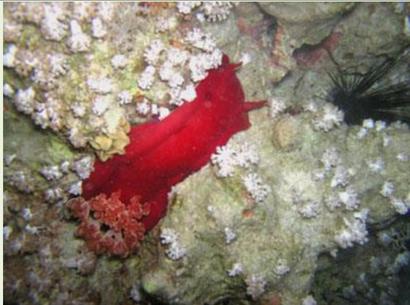
Spanish Dancer, a large nudibranch about 8" long