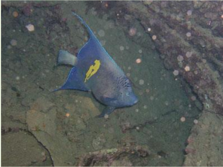
Arabian Angel Fish on the Thistlegrom