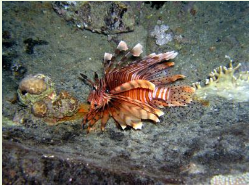
Lionfish on the deck of the Thistlegorm