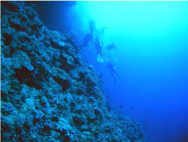
The ref wall at Big Brother, just beyond the Aida