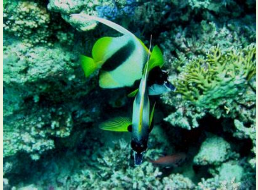
Pair of Bannerfish