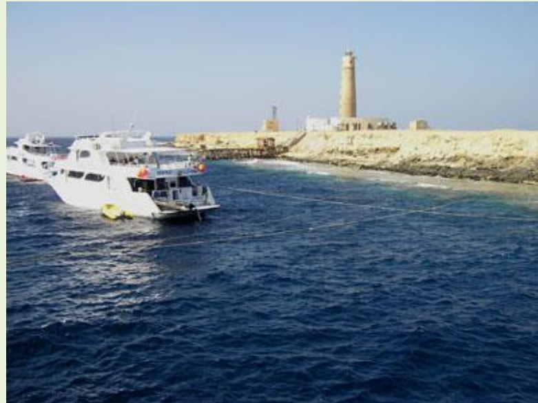
Big Brother lighthouse