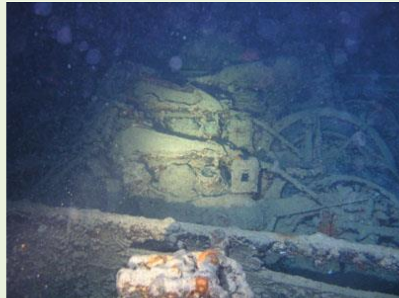
Motorcycles loaded in the back of lorries on the Thistlegorm