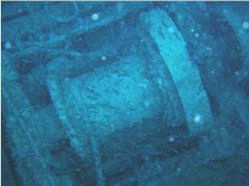
Looking down onto the lower deck of the Rosalie Moller.